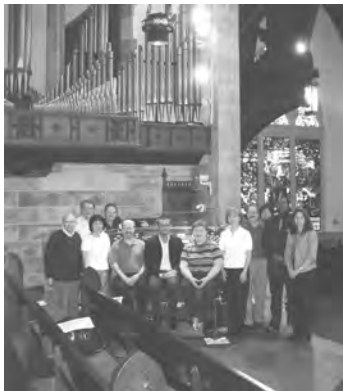
The Saturday Morning Masterclass