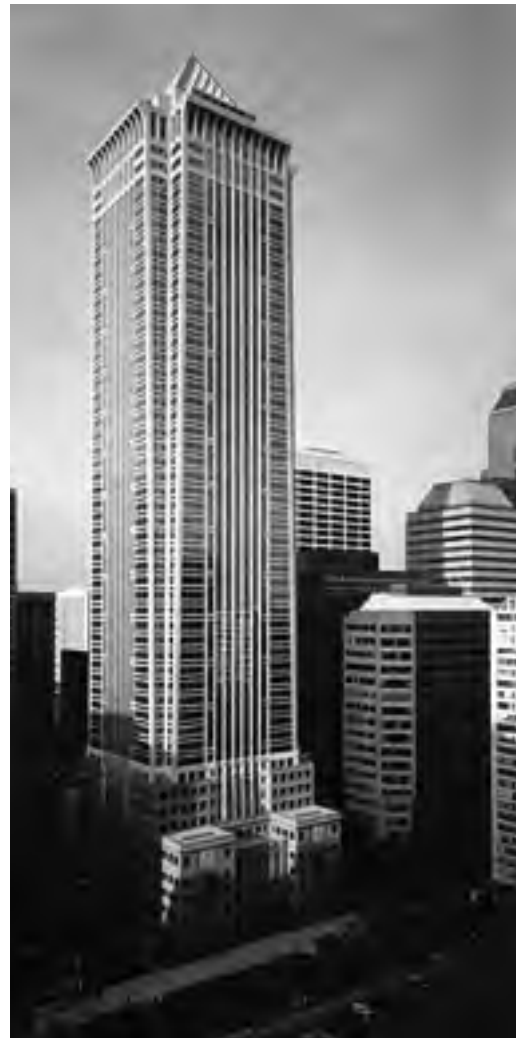
Mellon Bank Building 18th and Market Streets, Philadelphia